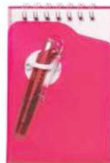
S8023 MINI NOTEPAD with PEN

DIMENSION : 9 CM (L) X 13 CM (H) COLOR : ● ● ●