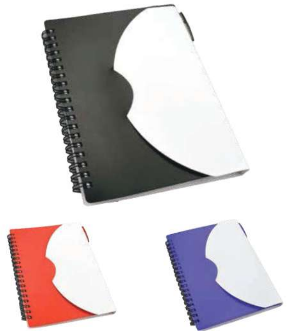
S8058 NOTEPAD with PEN

DIMENSION : 12 CM (L) X 16 CM (H) COLOR : ● ● ● ●