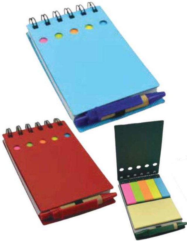
S8041 MINI MEMO PAD

DIMENSION : 7.9 CM (L) X 12.5 CM (H) COLOR : ● ● ● ●