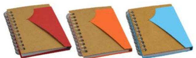
S8053 MINI NOTEPAD

DIMENSION : 8 CM (W) X 11.5 CM (H) COLOR : ● ● ● ●