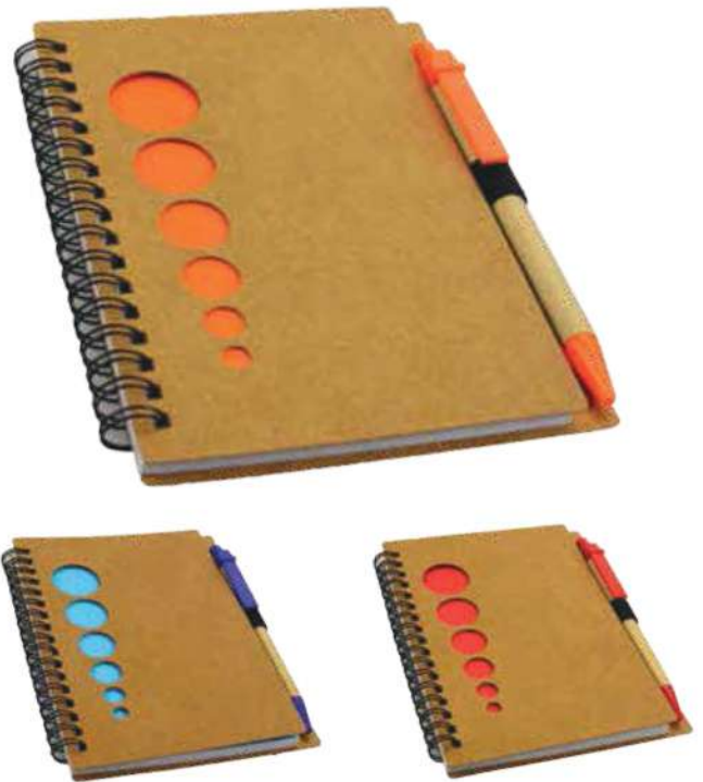
S8031 NOTEPAD with PEN

DIMENSION : 7.9 CM (L) X 12.5 CM (H) COLOR : ● ● ● ●