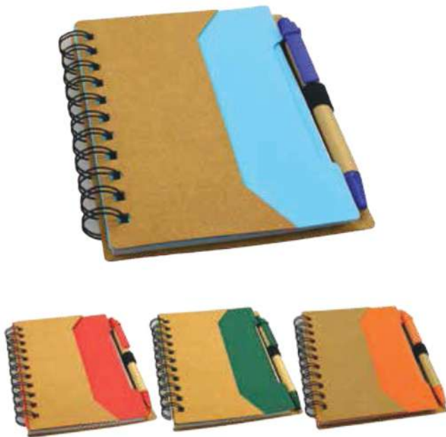
S8056 NOTEPAD with PEN

DIMENSION : 10.8 CM (L) X 16 CM (H) COLOR : ● ● ● ●