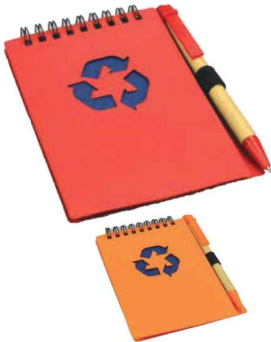
S8051 ECO NOTEPAD with PEN

DIMENSION : 10.4 CM (L) X 13.4 CM (H) COLOR : ● ● ●