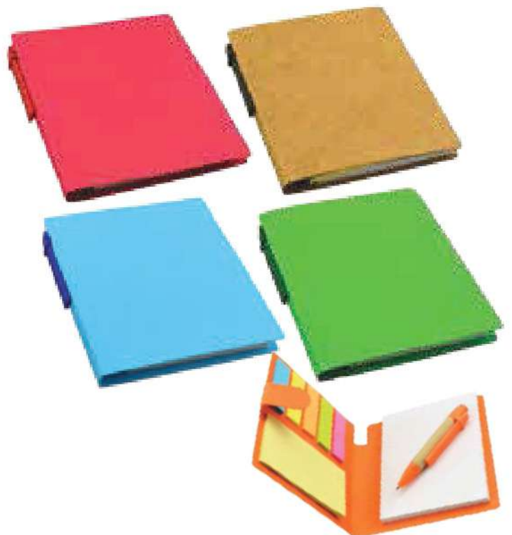
S8045 ECONOTEPAD with PEN

DIMENSION : 10.4 CM (L) X 13.4 CM (H) COLOR : ● ● ●